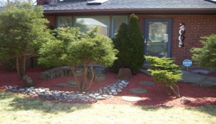
The Lovely Front View