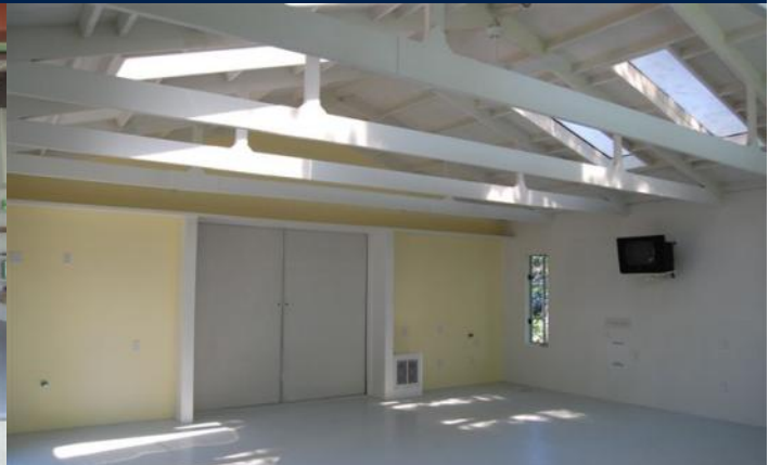
The Well-Lit Studio