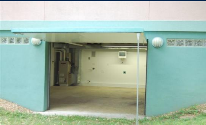
The Lower Garage/Workshop