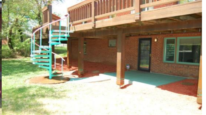
The Rear Deck with Spiral Staircase